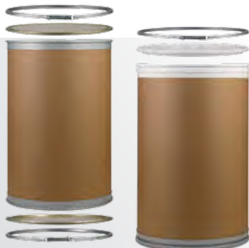
Hot Flo fiber drum

The MAUSER Flo fiber drum is equipped with a removable top for the transportation of cold products. We also offer a version with a removable top and bottom for use with hot substances. Both models have been especially designed for platen dispensing applications commonly used in the adhesive and food segments. An additional feature of the MAUSER Hot Flo fiber drum is that virtually 100% of the residual product can be recovered.