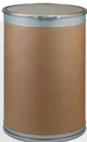
Overlay fiber drum

This special fiber drum model comes with an 8 mil (0.2 mm) white poly sleeve with memory. The poly sleeve offers several advantages: it can be trimmed and it prevents corrosion and rusting of the top chime. As no metal is exposed on the drum top, there are no sharp edges and users benefit from secure handling. This fiber drum model also has a clean, sanitary appearance.